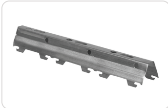
Carrier Type (84C-184C)