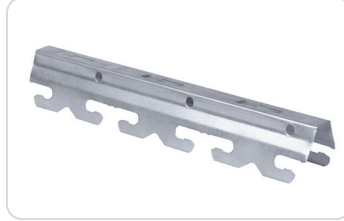
Carrier Type (84R)