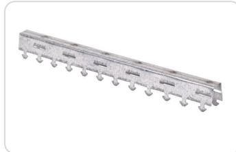
Carrier Type (150V-200V)