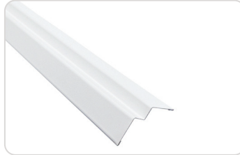
W - ANGLE