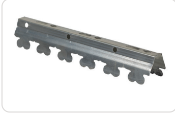
Carrier Type (134R)